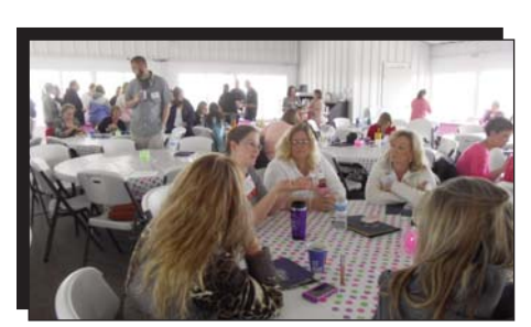
NSMA Awards Luncheon Attendees