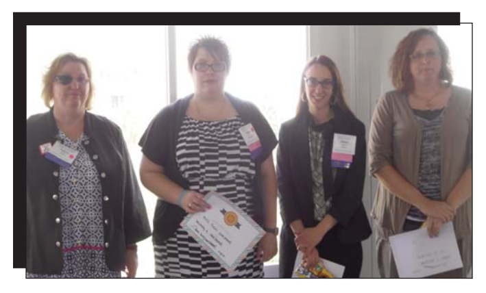
NSMA members that earned their CMA (AAMA) credential within the last year were honored during the Awards Luncheon at the 2014 State Conference.

Congratulations from the Nebraska Society of Medical Assistants