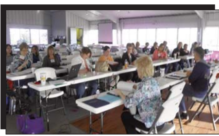
Preconference Board Meeting