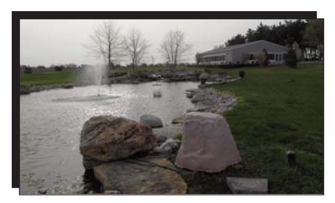
Colonial Gardens, site of the 2014 NSMA Conference