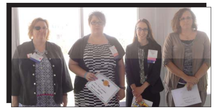
NSMA members that earned their CMA (AAMA) credential within the last year were honored during the Awards Luncheon at the 2014 State Conference.