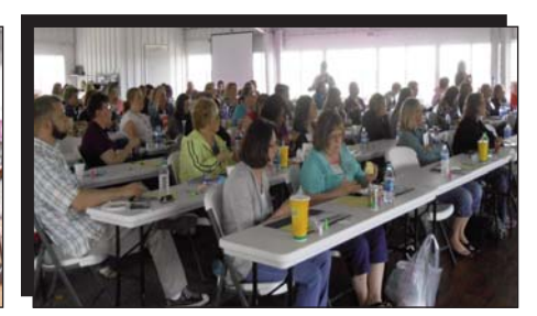
Attendees of the 2014 NSMA Conference